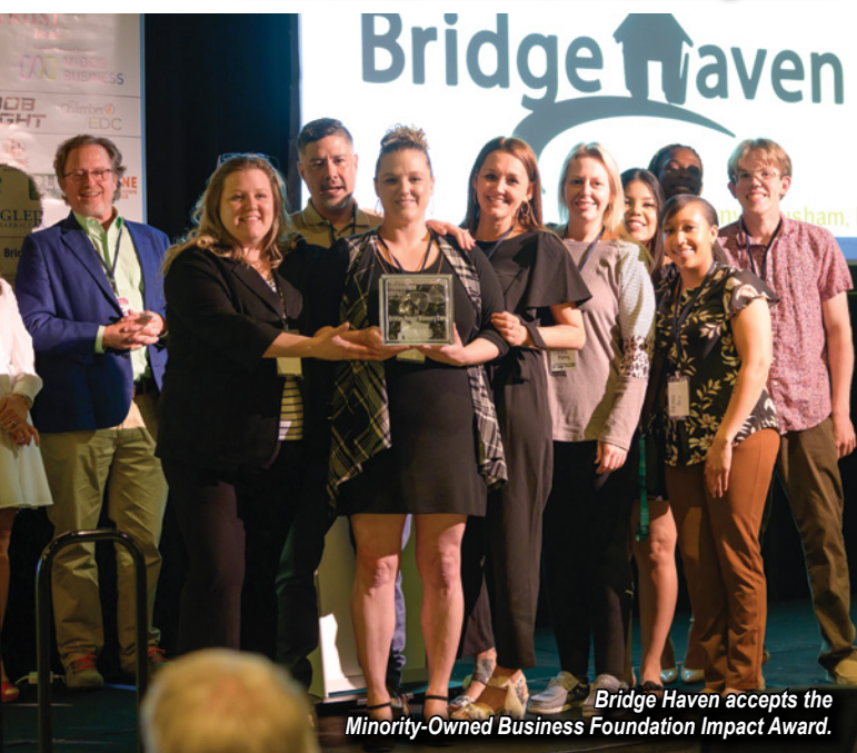
Bridge Haven accepts the Minority-Owned Business Foundation Impact Award.