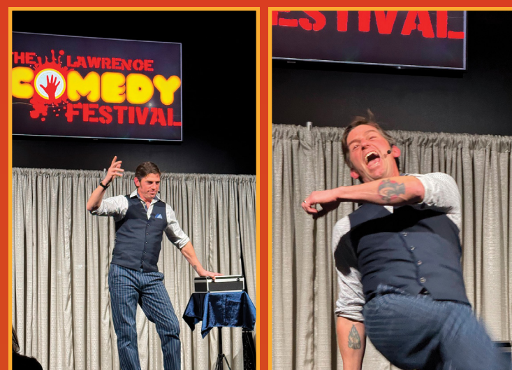
LAWRENCE COMEDY FESTIVAL