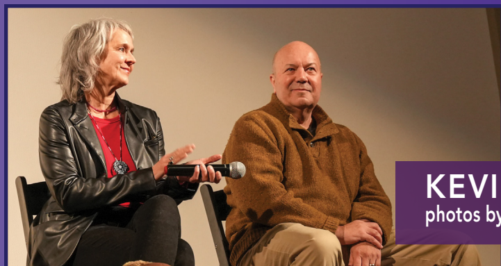
KEVIN WILLMOTT FILM FESTIVAL