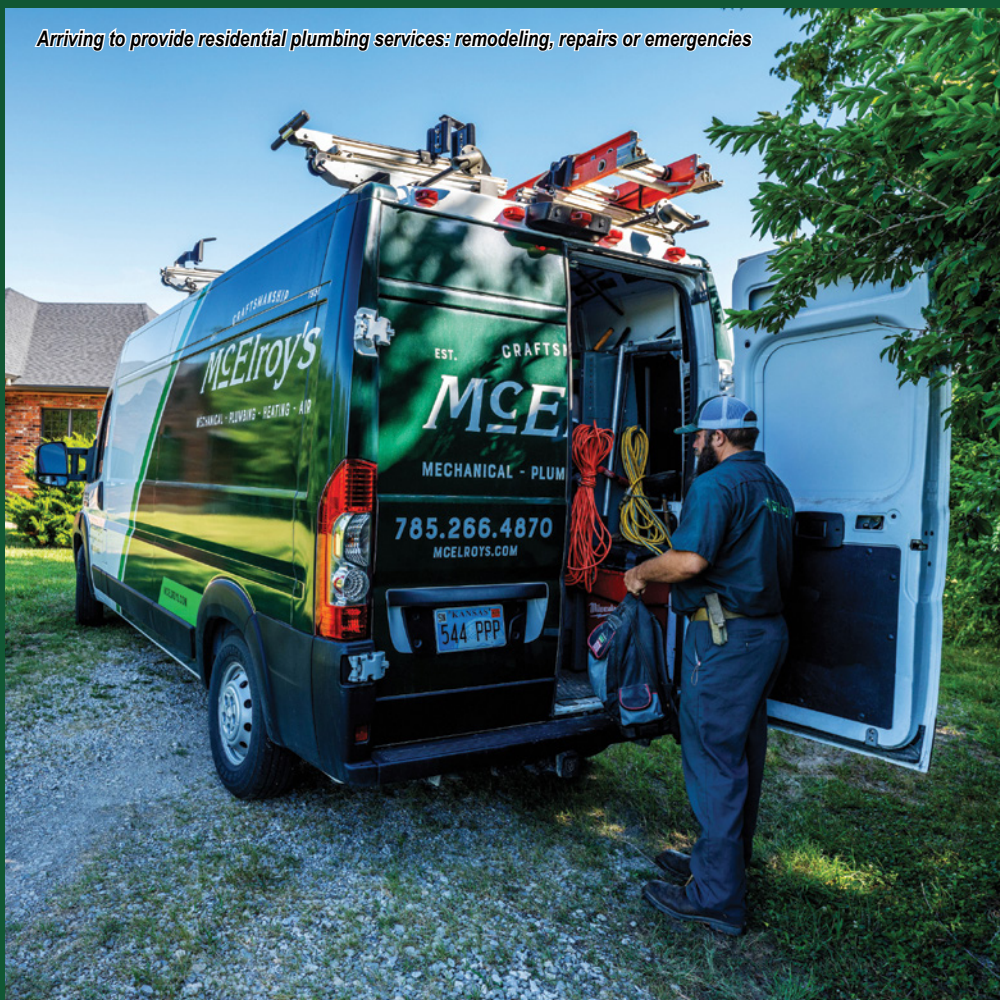
Arriving to provide residential plumbing services: remodeling, repairs or emergencies