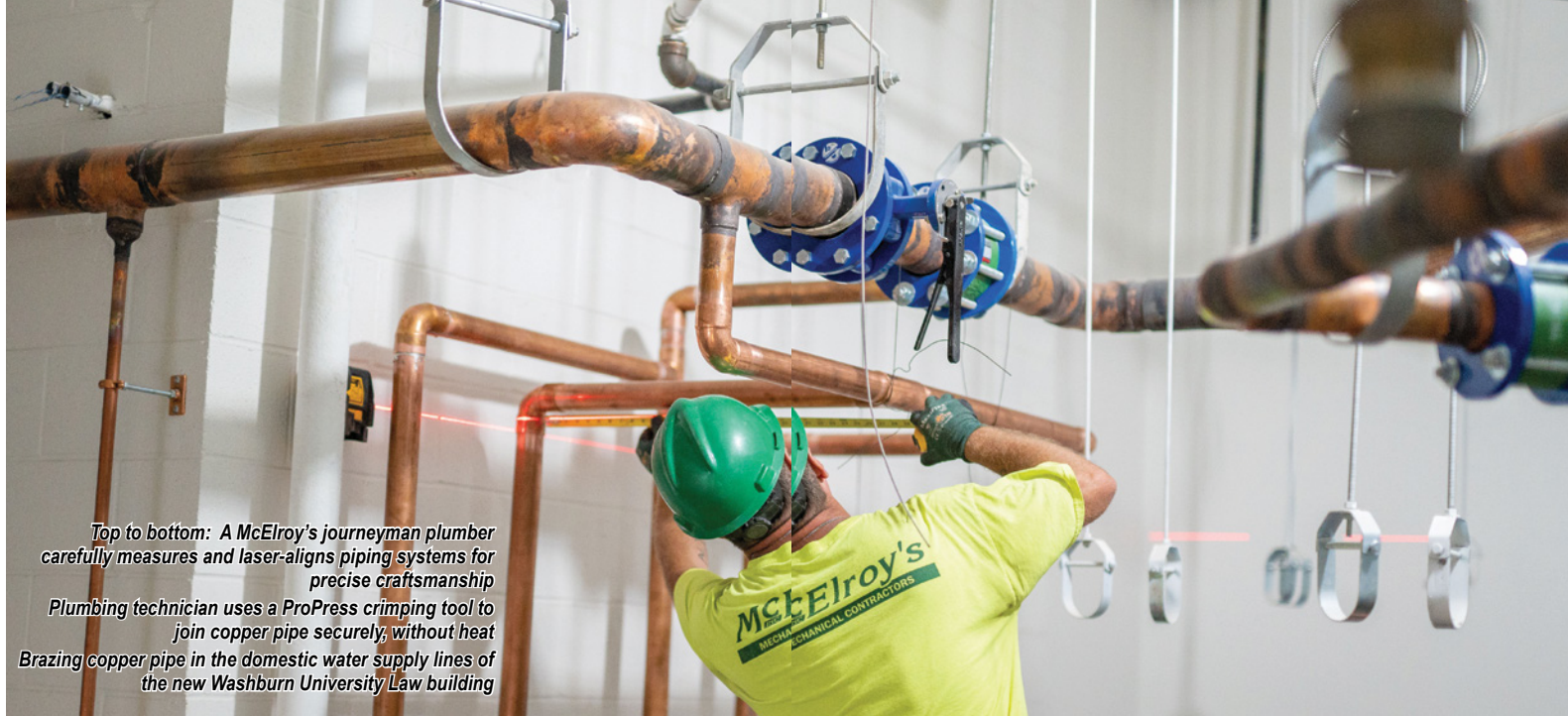
Top to bottom: A McElroy's journeyman plumber carefully measures and laser-aligns piping systems for precise craftsmanship Plumbing technician uses a ProPress crimping tool to join copper pipe securely, without heat Brazing copper pipe in the domestic water supply lines of the new Washburn University Law building